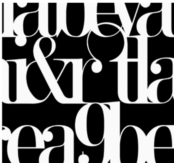
'Kensington' uses retro-modernist typography in this popular example from the Modernist range by Signarture™.

Fashion's influence on interiors is ever increasing. Just as fashion embraced all things vintage, so too has interior design: furniture, lighting and wallpaper manufacturers are re-releasing modern classics, while more and more leading international fashion houses are producing not only homewares but furniture as well. The art and design worlds are showing similar convergence: investors in contemporary art are now buying up the latest in design, and artists are creating works styled to complement the fashion-led trends in interiors ... great news for the majority of